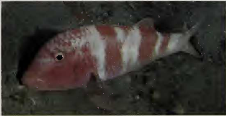
Fig. 5. Parupeneus fraserorum actively feeding, KwaZulu-Natal.